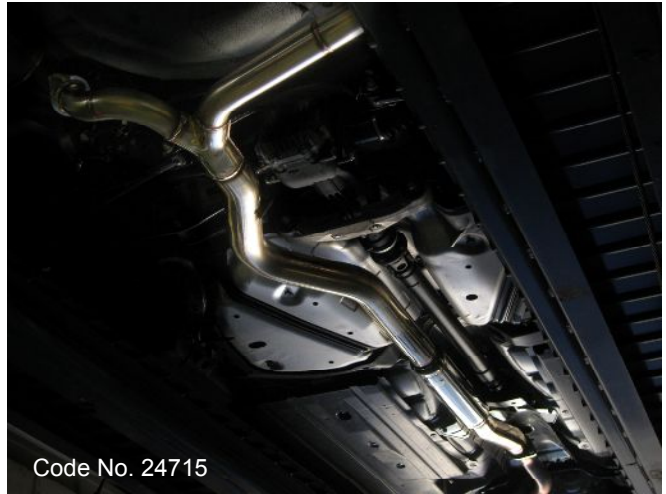
Code No. 24715

Note: by installing this product, exhaust note becomes louder.