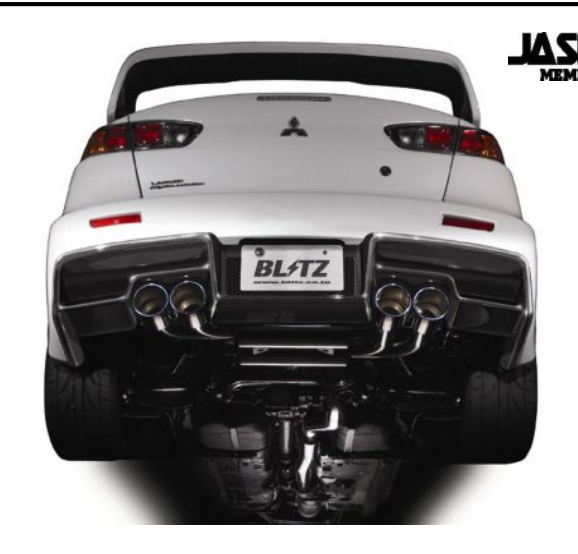
Actual product may look different from photo.