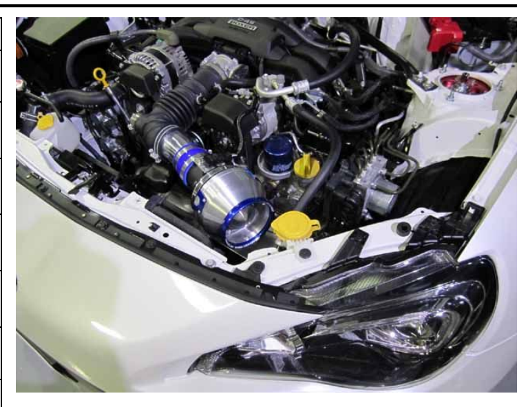
42128: ADVANCE POWER AIR CLEANER