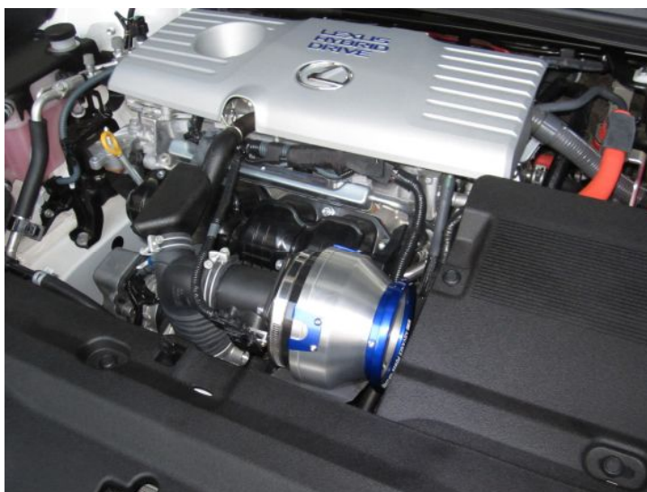
42178: ADVANCE POWER AIR CLEANER