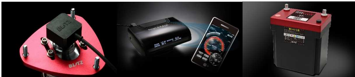
DAMPER ZZ-R Spec DSC

These are just three of the many items we will have on display at BLITZ booth.