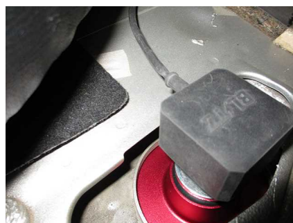
DAMPER ZZ-R SpecDSC Motor Clearance