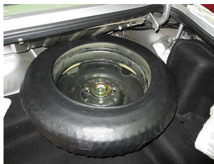
After spare tire mounts