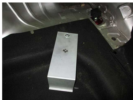
After stay mounts ※Product will be on Black Color.