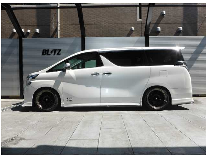
Front: -55mm down / Rear: -70 mm down