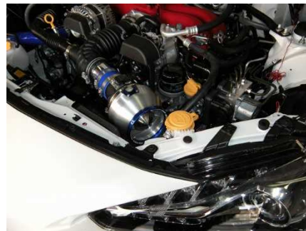
42128:ADVANCE POWER AIR CLEANER