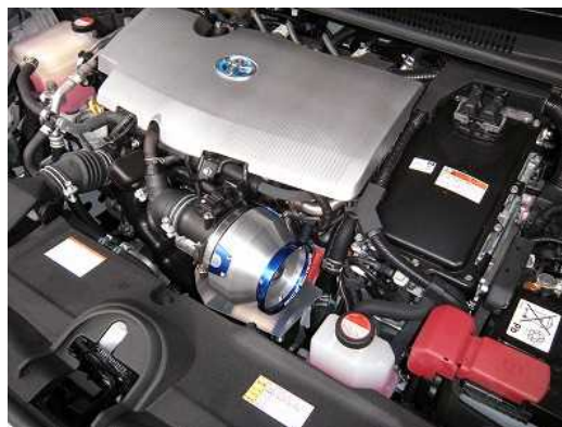
42237: ADVANCE POWER AIR CLEANER