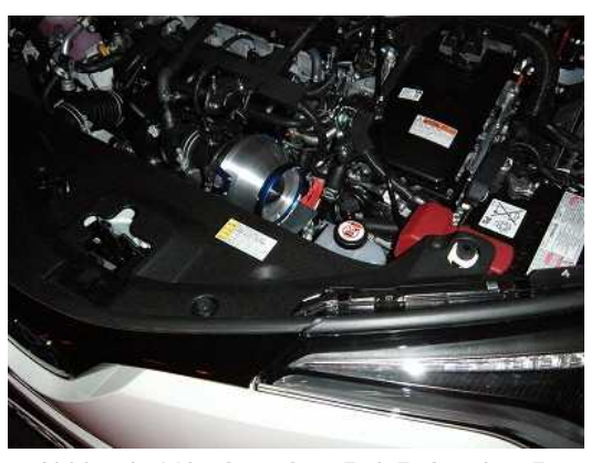
42237: ADVANCE POWER AIR CLEANER