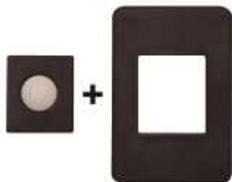
Switch + Service Panel Adapter