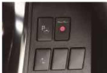
1 スイッチ本体+ サービスパネルアダプター