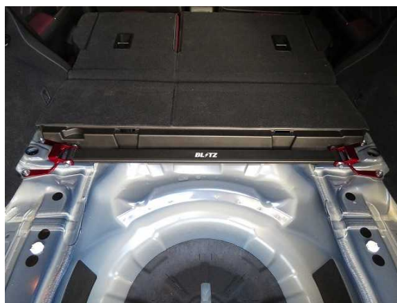
Part No:96101 SUBARU LEVORG VMG Rear