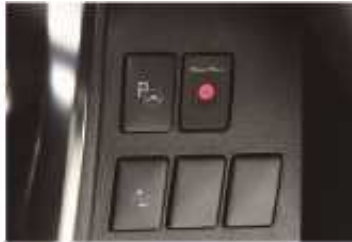
1 スイッチ本体+ サービスパネルアダプター