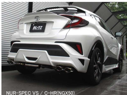
NÜR-SPEC VS / C-HR(NGX50)