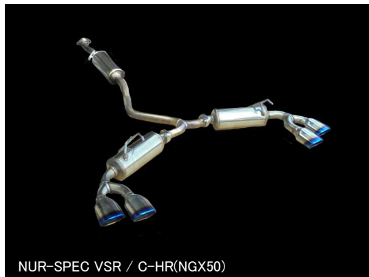
NÜR-SPEC VSR / C-HR(NGX50)