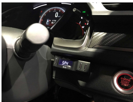
Installation to the CIVIC Hatchback