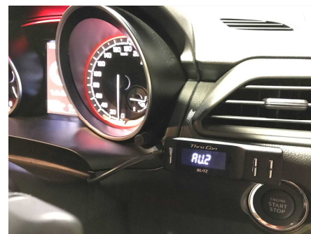
Installation to the SWIFT Sport