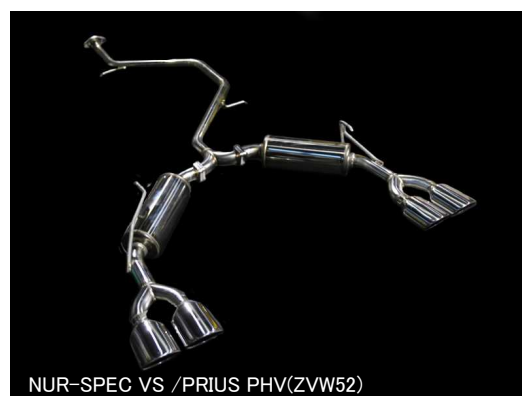
NUR-SPEC VS /PRIUS PHV(ZVW52)