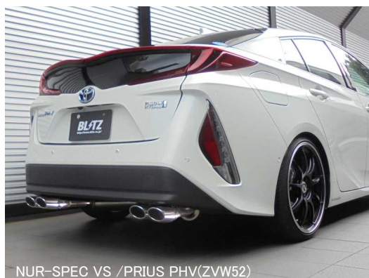
NUR-SPEC VS /PRIUS PHV(ZVW52)

Tail design finished with an elegant mirror surface