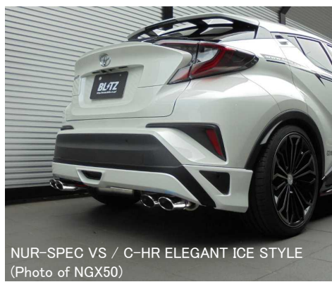
NUR-SPEC VS / C-HR ELEGANT ICE STYLE (Photo of NGX50)