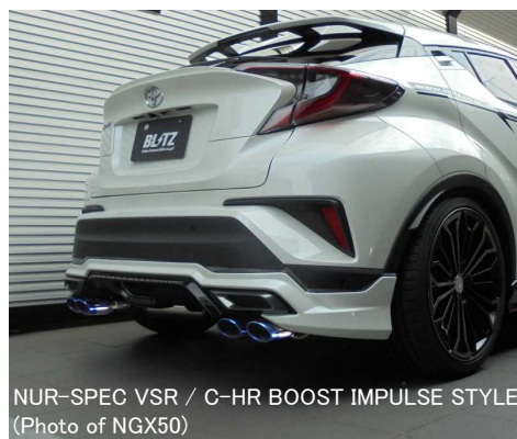
NUR-SPEC VSR / C-HR BOOST IMPULSE STYLE (Photo of NGX50)

Tail design finished with an elegant mirror surface