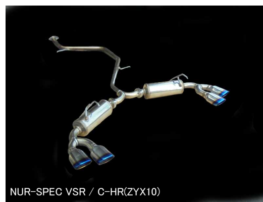
NUR-SPEC VSR / C-HR(ZYX10)