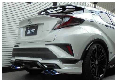
NUR-SPEC VSR / C-HR BOOST IMPLUSE STYLE

Tail design finished with an elegant mirror surface