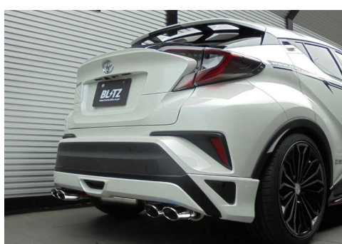
NUR-SPEC VS / C-HR ICE ELEGANT STYLE