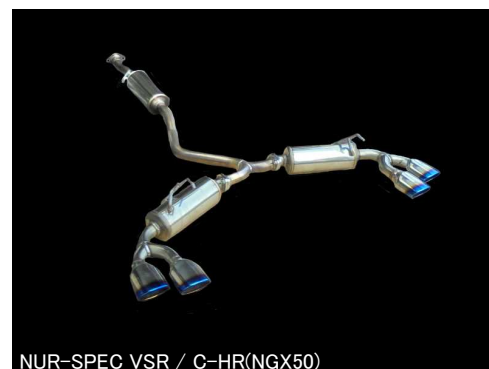
NUR-SPEC VSR / C-HR(NGX50)