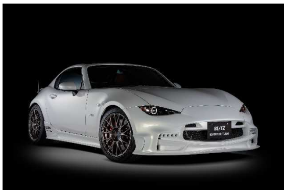
ROADSTER RF (NDERC)