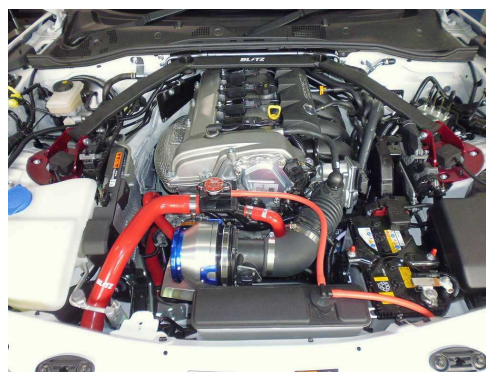
42246:ADVANCE POWER AIR CLEANER