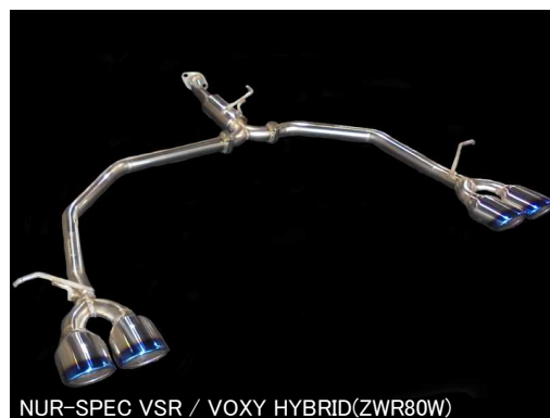
NUR-SPEC VSR / VOXY HYBRID(ZWR80W)