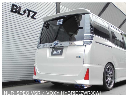
NUR-SPEC VSR / VOXY HYBRID(ZWR80W)

Tail design finished with an elegant mirror