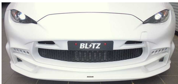
Installation example on the BLITZ Front Bumper