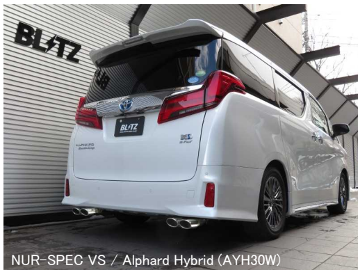
NUR-SPEC VS / Alphard Hybrid (AYH30W)

Tail design finished with an elegant mirror surface