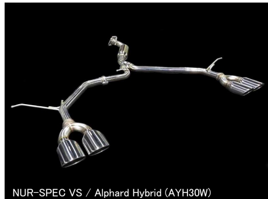
NUR-SPEC VS / Alphard Hybrid (AYH30W)