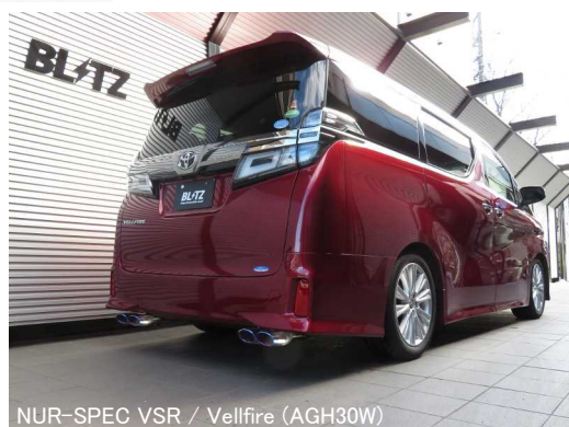
NUR-SPEC VSR / Vellfire (AGH30W)

Tail design finished with an elegant mirror surface