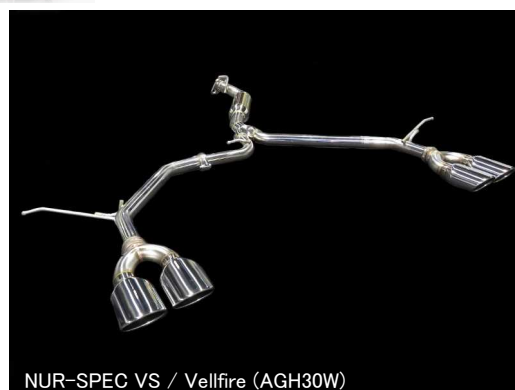
NUR-SPEC VS / Vellfire (AGH30W)