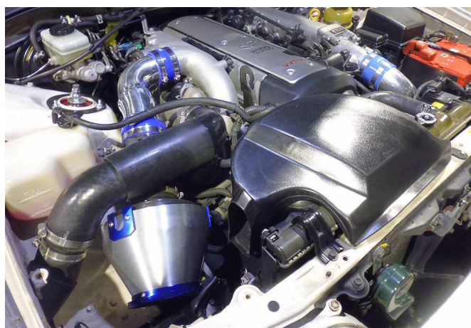
※Equipped with ADVANCE POWER AIR CLEANER (Sold Separately)