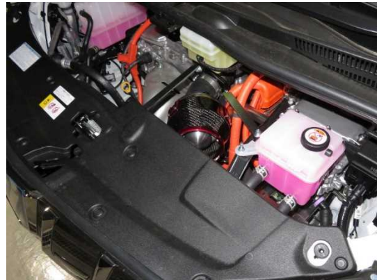
35228: CARBON POWER AIR CLEANER