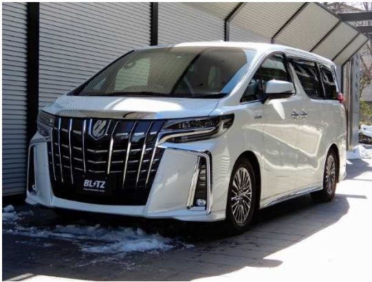
ALPHARD HYBRID (AYH30W)