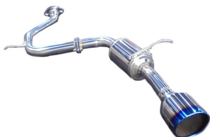
NUR-SPEC VSR / HARRIER

Tail design finished with an elegant mirror surface