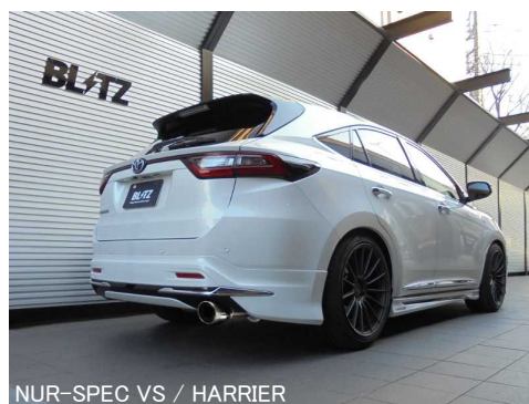
NUR-SPEC VS / HARRIER