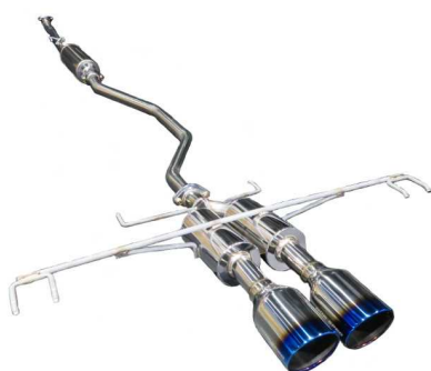
NUR-SPEC VSR / CIVIC HATCHBACK

Tail design finished with an elegant mirror surface