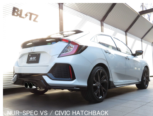
NUR-SPEC VS / CIVIC HATCHBACK