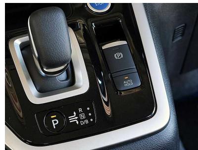
NISSAN SERENA e-Power