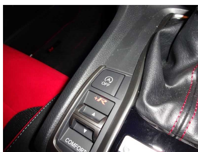
HONDA CIVIC TYPE R IDLING STOP