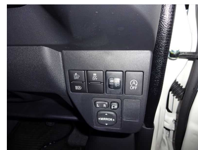
DAIHATSU HIJET IDLING STOP