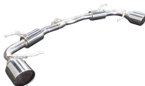
NUR-SPEC VS / CX-5