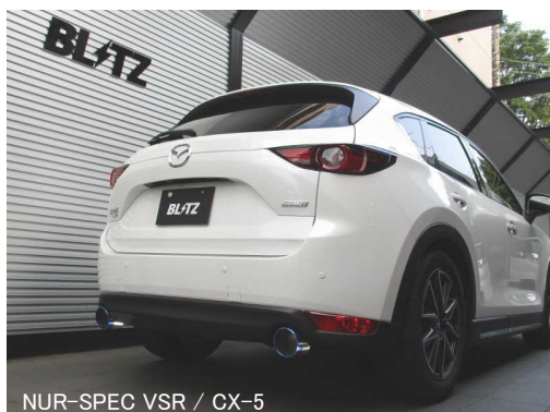
NUR-SPEC VSR / CX-5

Tail design finished with an elegant mirror surface