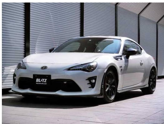
86 GR (ZN6)