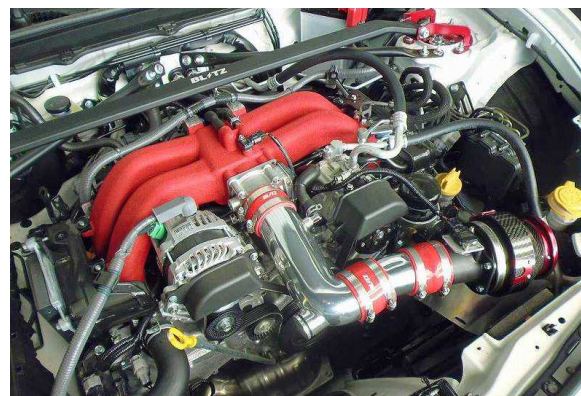
35128: CARBON POWER AIR CLEANER

※Image of air cleaner with SUCTION KIT (Code No. 55734)