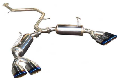
NUR-SPEC VSR /PRIUS PHV(GR SPORT)

Tail design finished with an elegant mirror surface