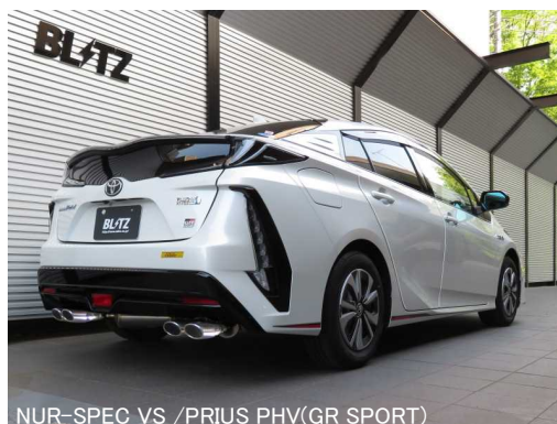
NUR-SPEC VS /PRIUS PHV(GR SPORT)