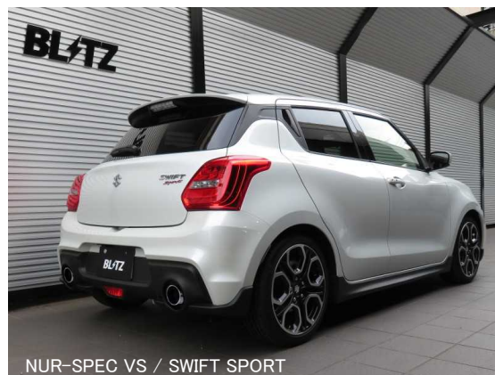
NUR-SPEC VS / SWIFT SPORT