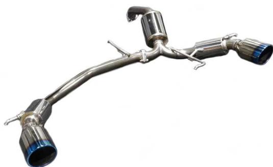
NUR-SPEC VSR / SWIFT SPORT

Tail design finished with an elegant mirror surface