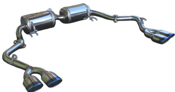
NUR-SPEC VSR / ODYSSEY HYBRID

Tail design finished with an elegant mirror surface