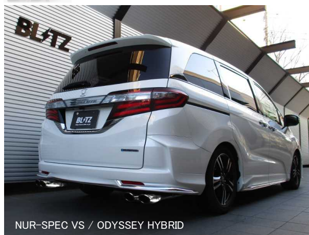
NUR-SPEC VS / ODYSSEY HYBRID