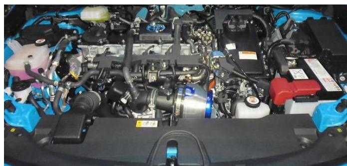
42237 : ADVANCE POWER AIR CLEANER