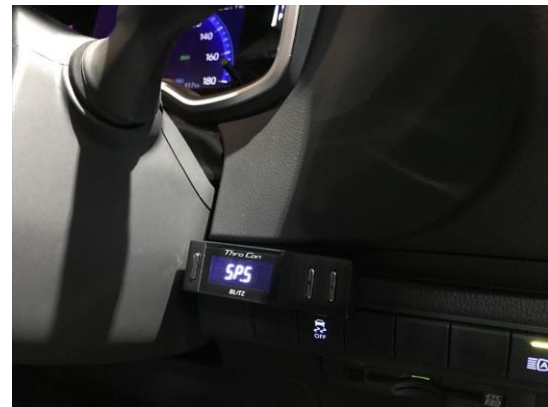
TOYOTA COROLLA SPORT