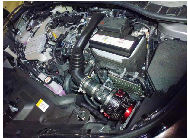
35242 : CARBON POWER AIR CLEANER