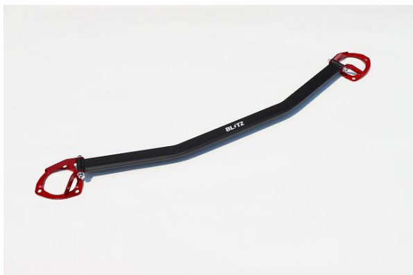
Product Number: 96163 FK7/FC1 Front