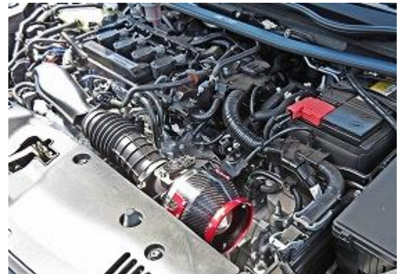
35248: CARBON POWER AIR CLEANER