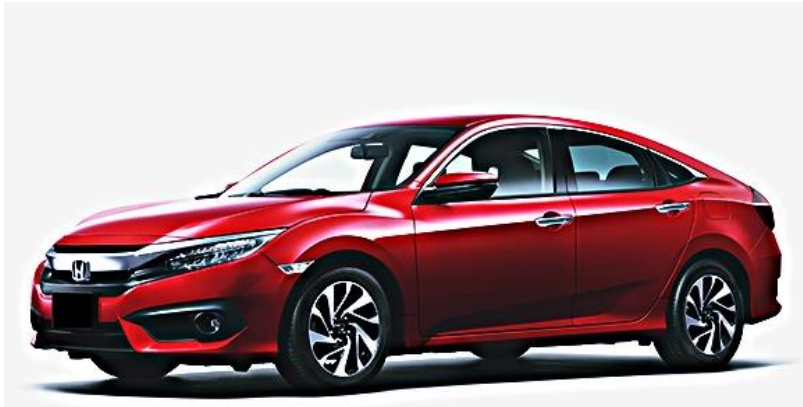
CIVIC SEDAN (FC1)