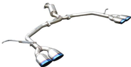
NUR-SPEC VSR /ALPHARD・VELLFIRE(GGH30W)

Tail design finished with an elegant mirror