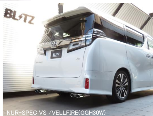
NUR-SPEC VS /VELLFIRE(GGH30W)