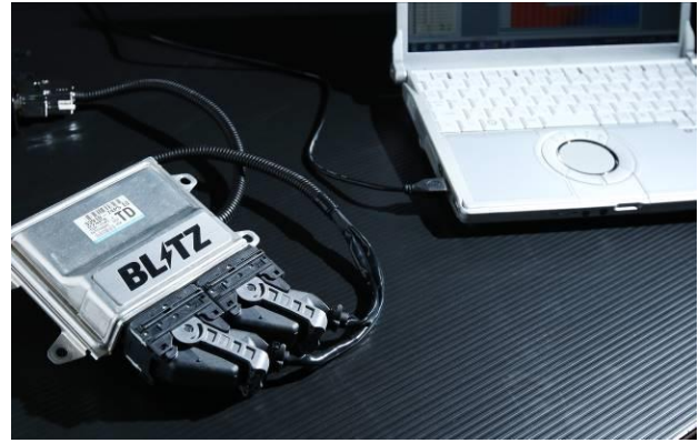
BLITZ TUNING ECU