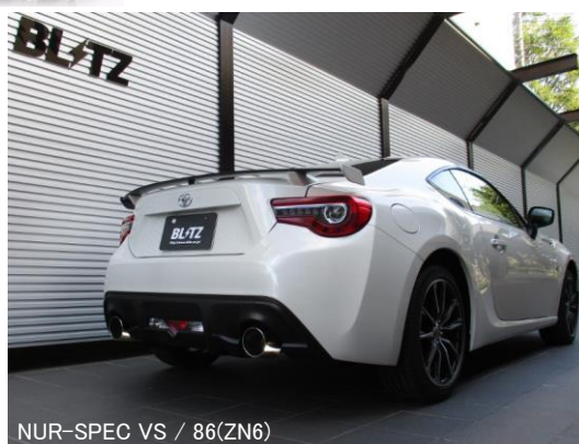
NUR-SPEC VS / 86(ZN6)

Tail design finished with an elegant mirror surface