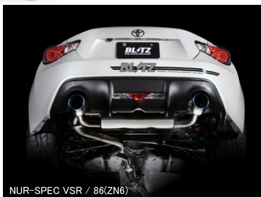
NUR-SPEC VSR / 86(ZN6)

Race inspired Titanium colored tail design