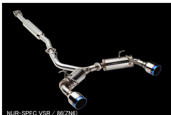
NUR-SPEC VSR / 86(ZN6)

Race inspired Titanium colored tail design