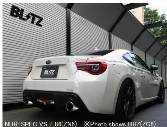
NUR-SPEC VS / 86(ZN6) ※Photo shows BRZ(ZC6)

Tail design finished with an elegant mirror surface