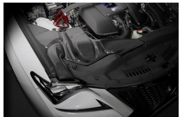
Installation Example (Close Up)