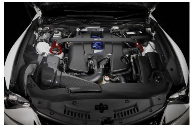
Installation Example (Complete View)