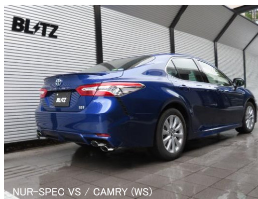
NUR-SPEC VS / CAMRY (WS)

Tail design finished with an elegant mirror surface