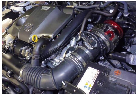
35250 : CARBON POWER AIR CLEANER