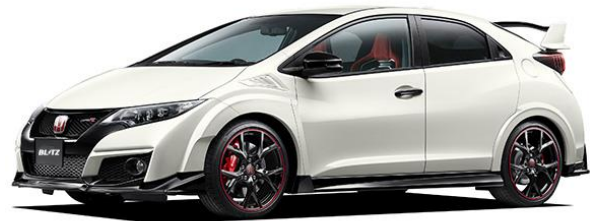
HONDA CIVIC TYPE R