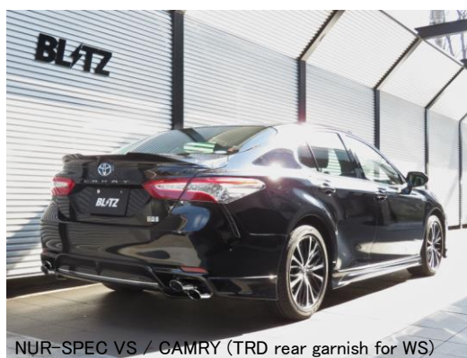
NUR-SPEC VS / CAMRY (TRD rear garnish for WS)

Tail design finished with an elegant mirror surface