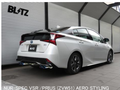
NUR-SPEC VSR / PRIUS (ZVW51) AERO STYLING