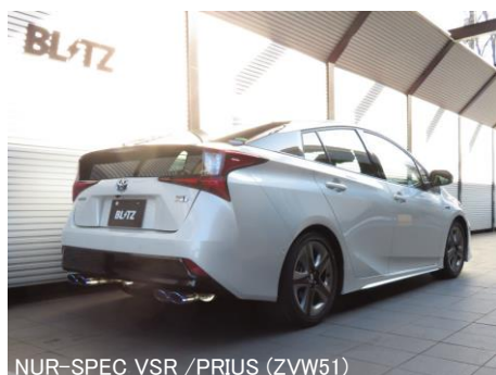
NUR-SPEC VSR / PRIUS (ZVW51)

Tail design finished with an elegant mirror surface