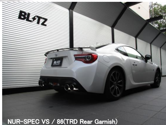
NUR-SPEC VS / 86(TRD Rear Garnish)

Tail design finished with an elegant mirror surface