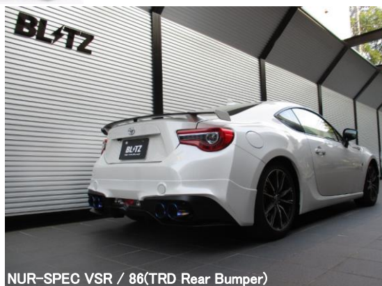
NUR-SPEC VSR / 86(TRD Rear Bumper)

Race inspired Titanium colored tail design